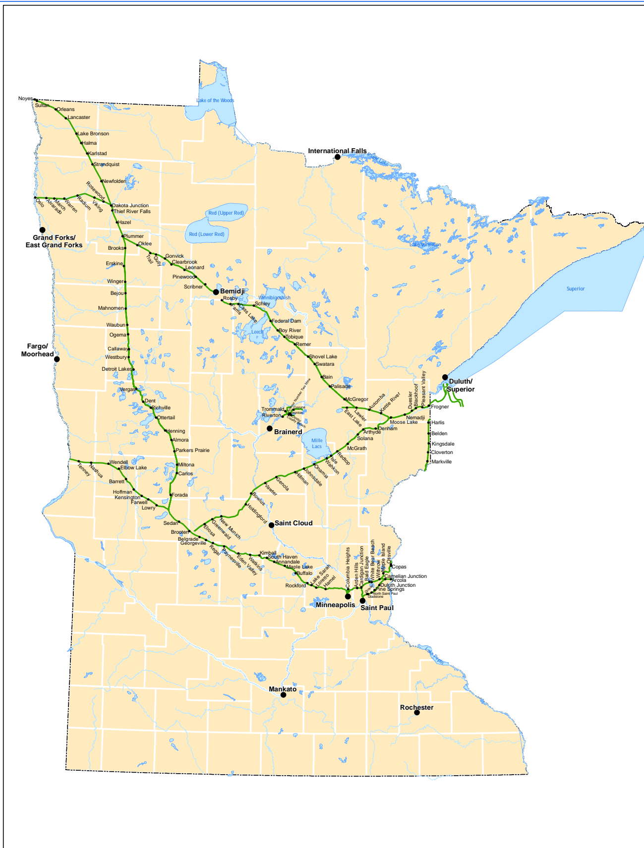
Map adapted from the MN DNR division of Fish and Wildlife 100k Lakes and Rivers and 100k Hydrography, Railroad Commissioners Map of Minnesota, 1930 and MN DOT Abandoned Railroads GIS data. Plot Date: 1/16/2007