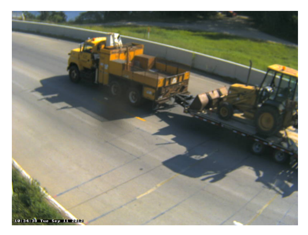
Photo 29A: Class 9, 5 axle, Truck with Trailer; Service Truck; Construction; Utility: w/Construction Equipment.