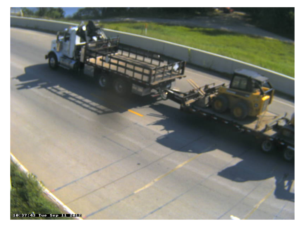
Photo 30B: Class 10, 6 axle, Truck with Trailer; Stake Truck; Construction; w/Construction Equipment.