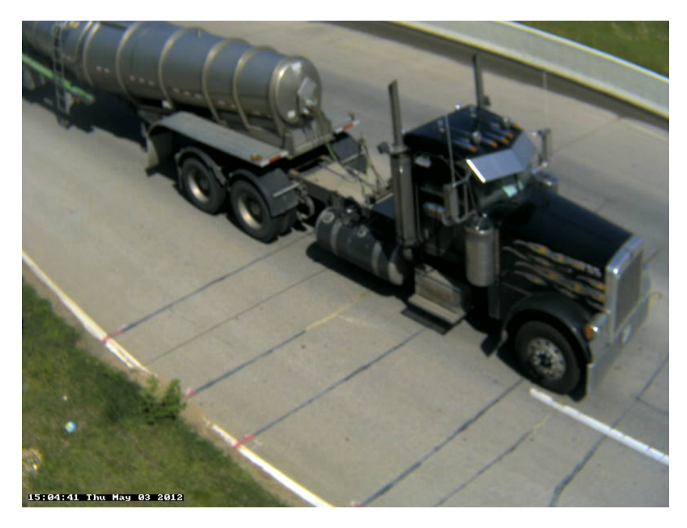
Photo 37A: Class 9, 5 axle, Semi-Tractor with Trailer; Tanker; Liquid.