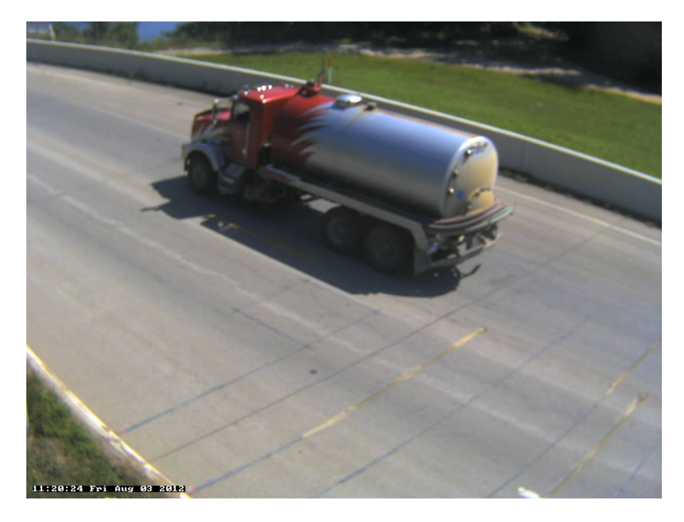
Photo 36A: Class 6, 3 axle, Single Unit; Tanker; Waste; Vacuum Truck; Septic or Liquid Waste.