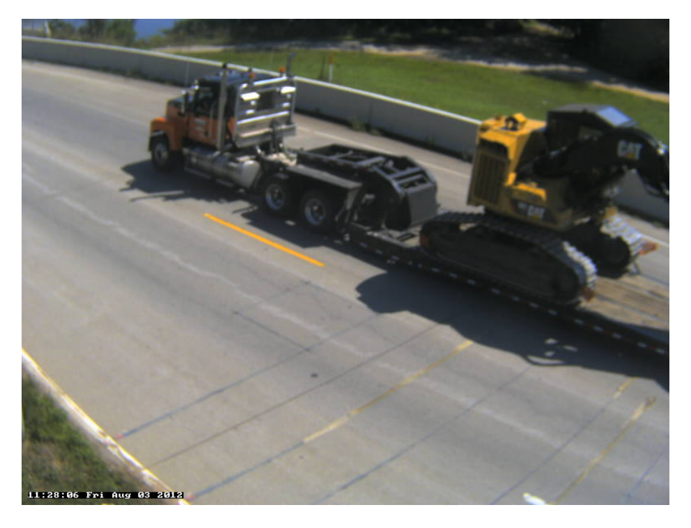
Photo 24A: Class 9, 5 axle, Semi-Tractor with Trailer; Low Boy; Construction Equipment.