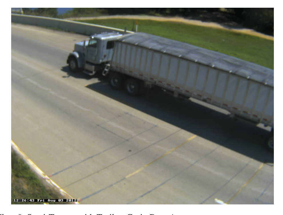
Photo 15B: Class 9, Semi-Tractor with Trailer; Grain Box, Aggregate.