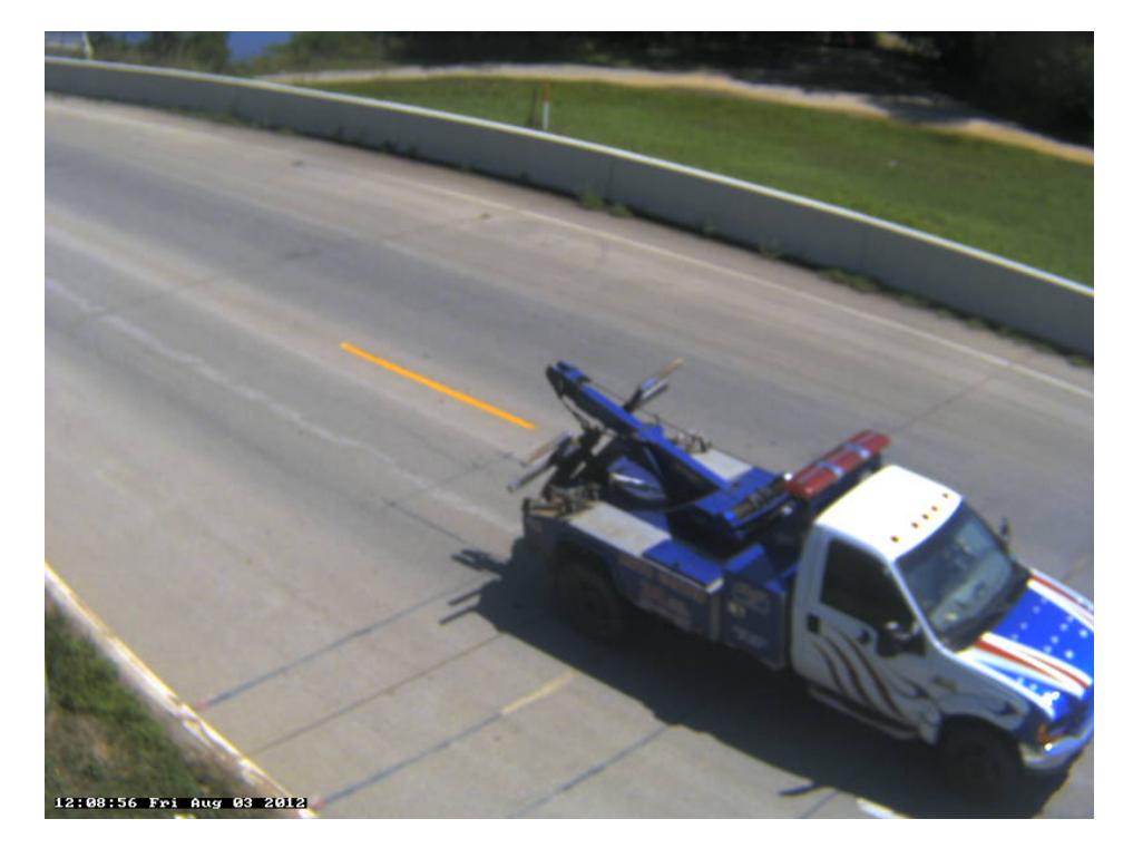
Photo 28B: Class 5, 2 axles, Single Unit; Service Truck; Tow Truck.