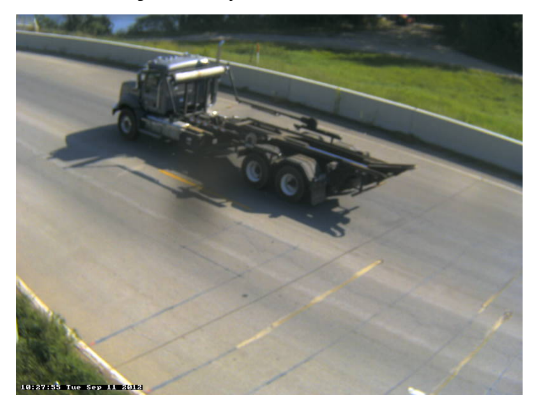
Photo 10B: Class 6, 3 axle, Single Unit; Dumpster Hauler, No Dumpster.