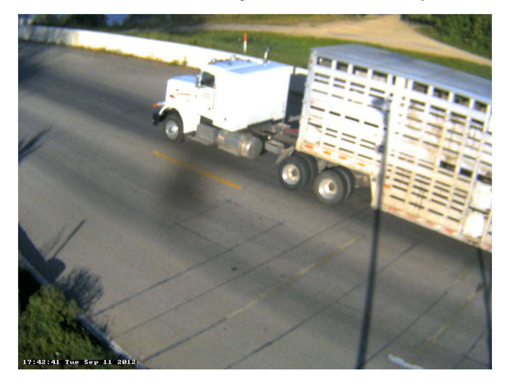
Photo 23B: Class 9, 5 axle, Semi-Tractor with Trailer; Agriculture; Livestock Trailer.