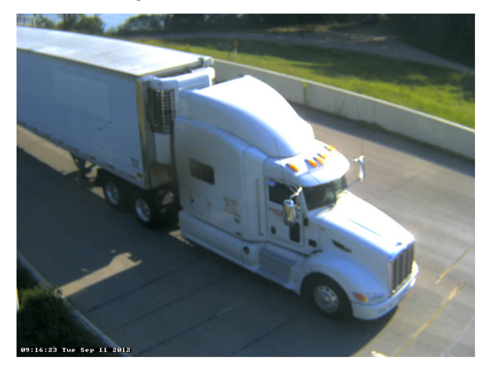
Photo 5B: Class 9, 5 axle, Semi-Tractor with Trailer; Box; Reefer.