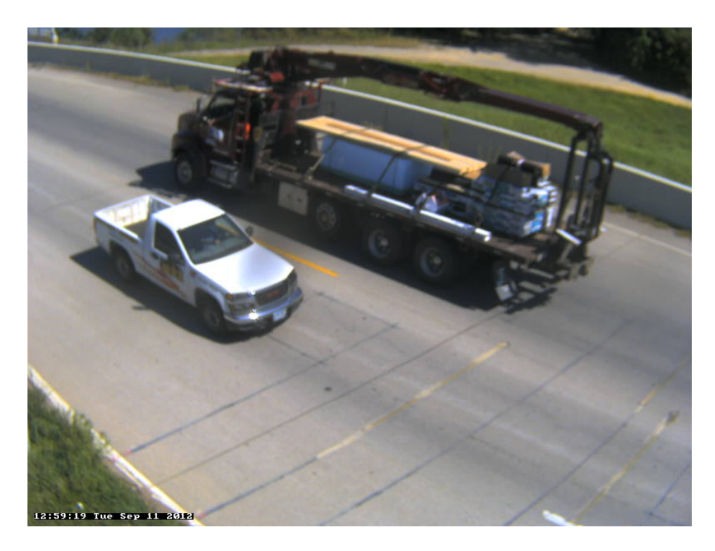
Photo 14A: Class 6, 3 axles, Single Unit; Flatbed; Construction – Materials; w/Hoist, Loaded.