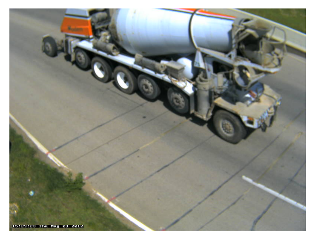
Photo 7B: Class 7, 4+ axle, Single Unit; Construction; Concrete Truck.