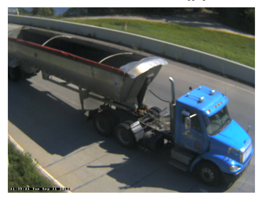
Photo 16B: Class 9, 5 axle, Semi-Tractor with Trailer; End-Dump Hopper, Aggregate.