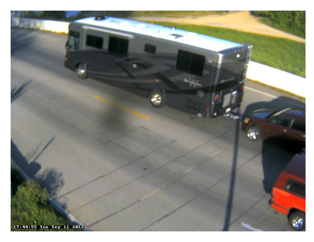
Photo 25A: Class 4, 2 axles, Single Unit; Recreational Vehicle; w/Car being towed.