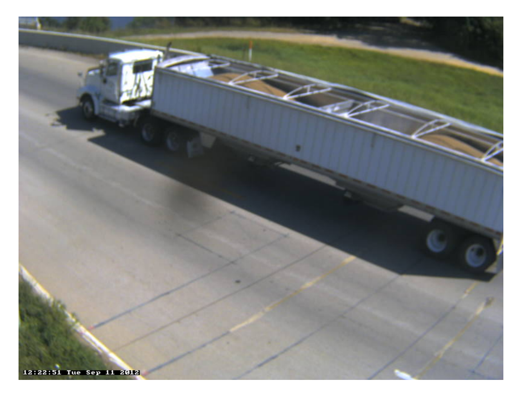
Photo 16A: Class 9, 5 axle, Semi-Tractor with Trailer; Grain Box; Aggregate.