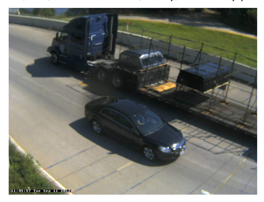
Photo 24B: Class 8: 4 axle, Semi-Tractor with Trailer; Lowboy; Auto parts.