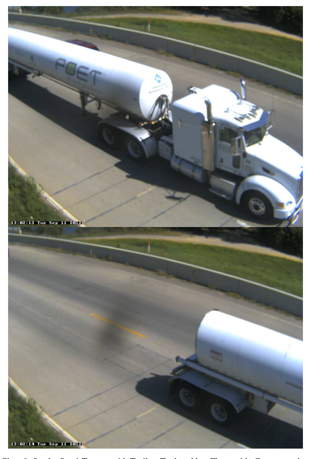
Photo 32: Class 9, 5 axle, Semi-Tractor with Trailer; Tanker; Non-Flammable Compressed gas.