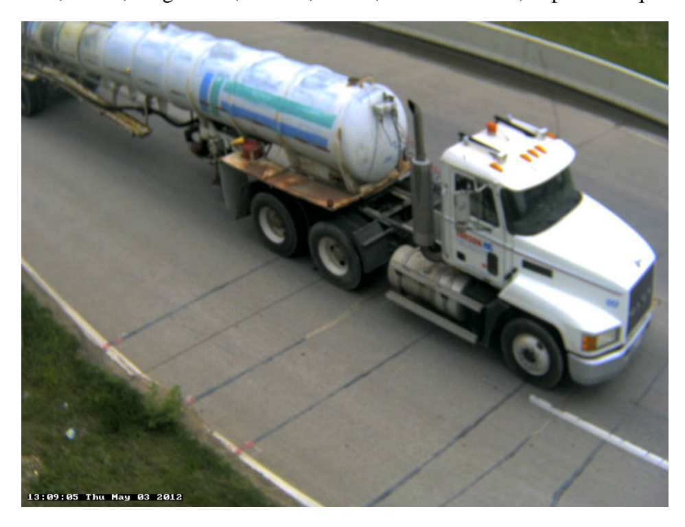
Photo 36B: Class 9, 5 axle, Semi-Tractor with Trailer; Tanker; Liquid.