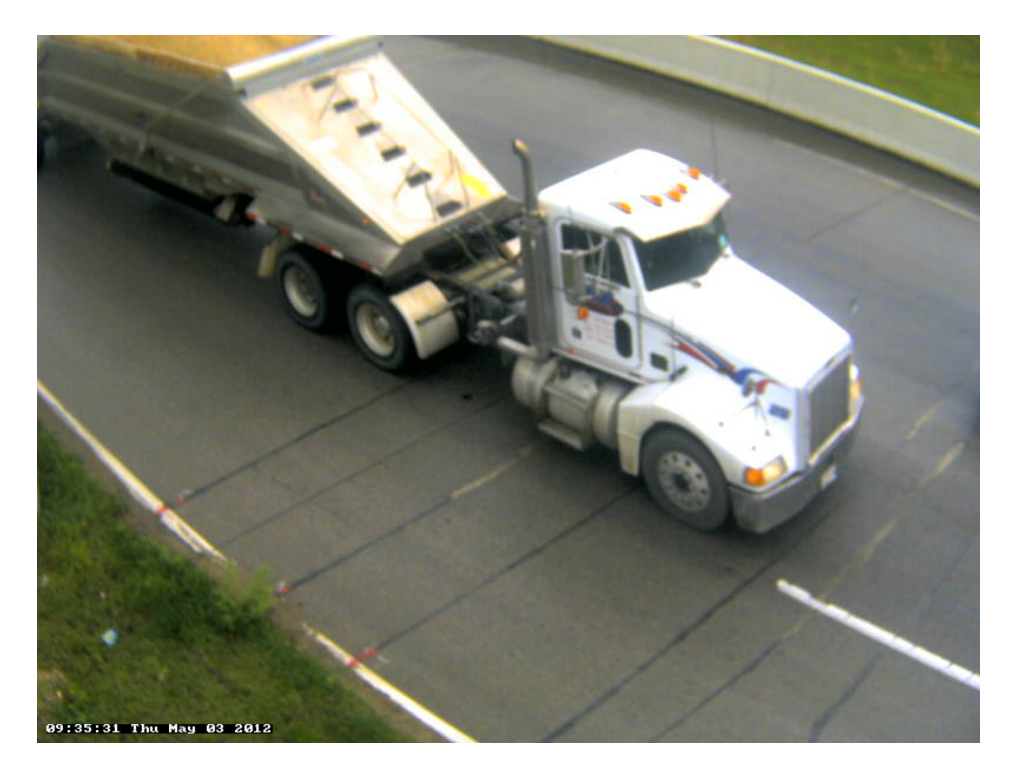
Photo 17A: Class 9, 5 axle, Semi-Tractor with Trailer; Heavy-Duty Bottom-Dump; Aggregate.