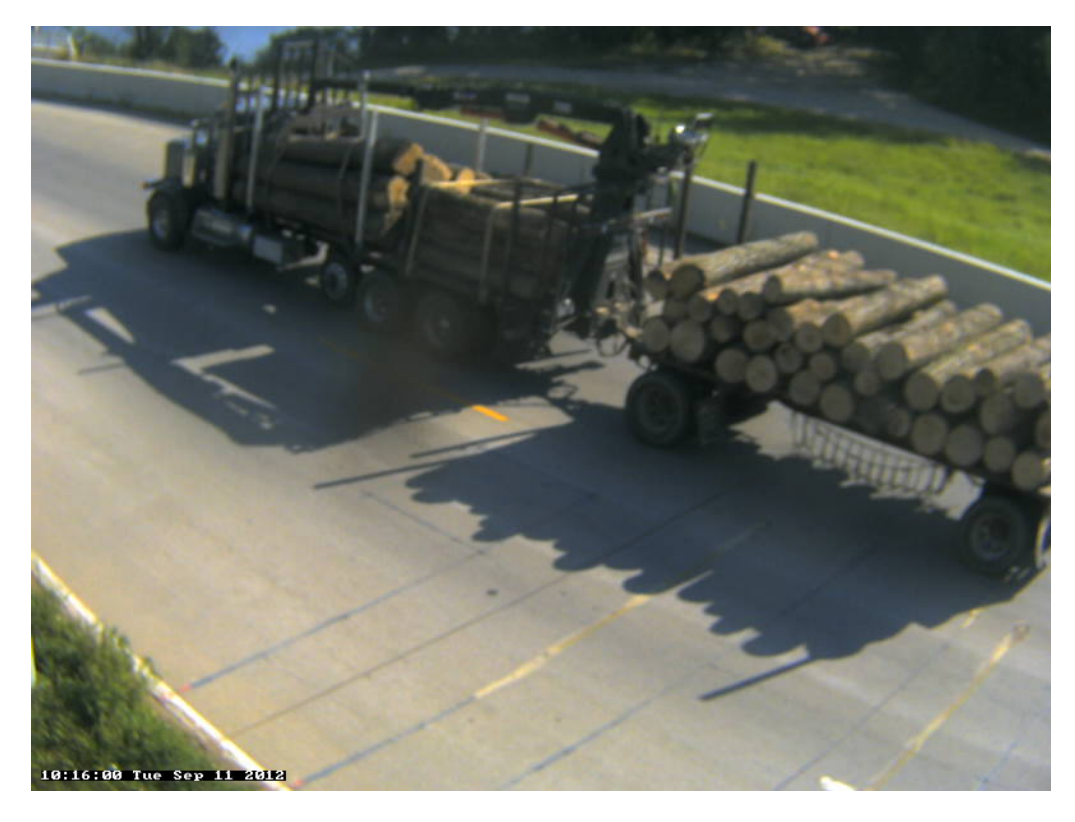
Photo 31A: Class 12, 6 axle Twin Trailer; Stake; Timber. This one weighed 102,000 pounds!