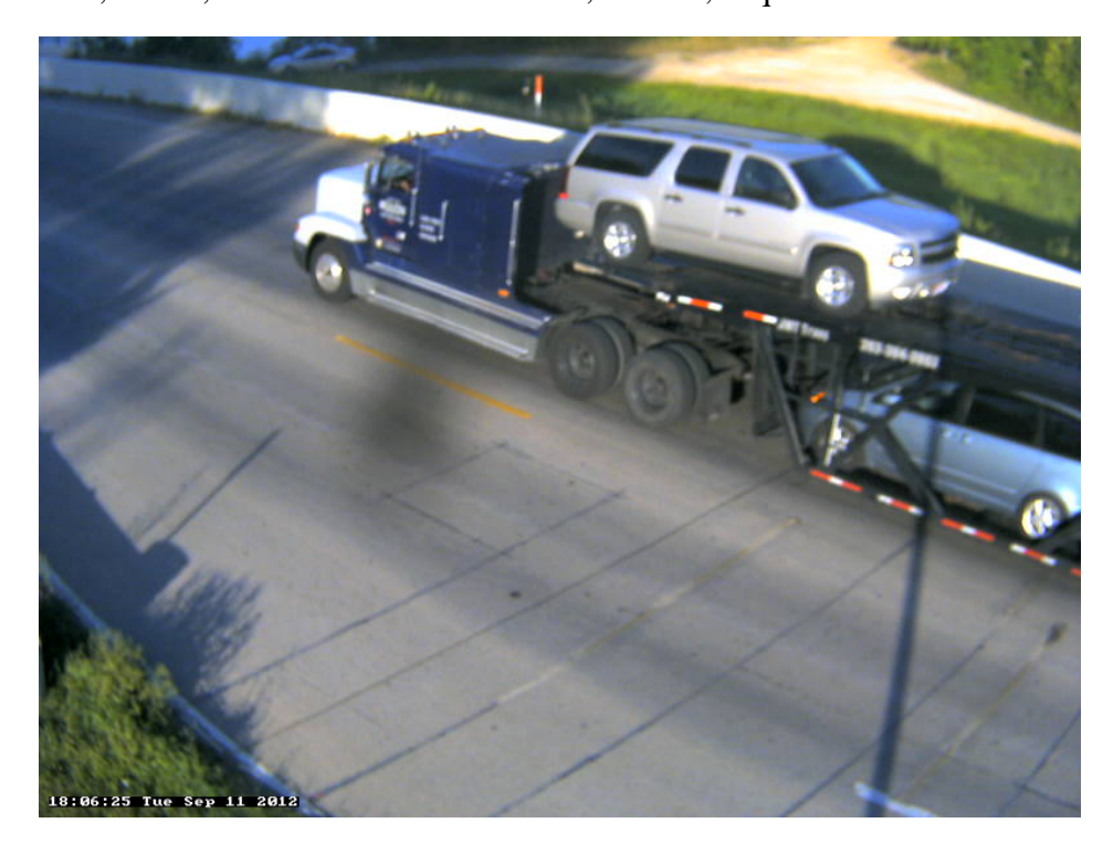
Photo 37B: Class 9: 5 axle, Semi-Tractor with Trailer; Shipping; Car Carrier.