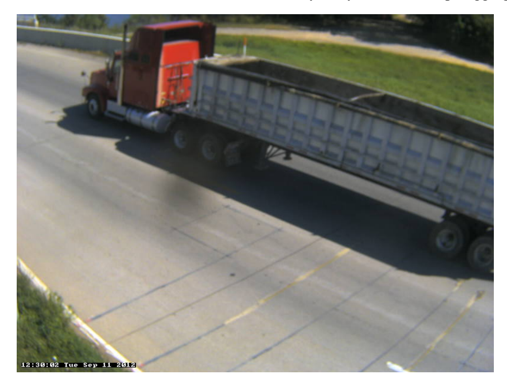
Photo 17B: Class 9, 5 axle, Semi-Tractor with Trailer; Grain Box; Aggregate.