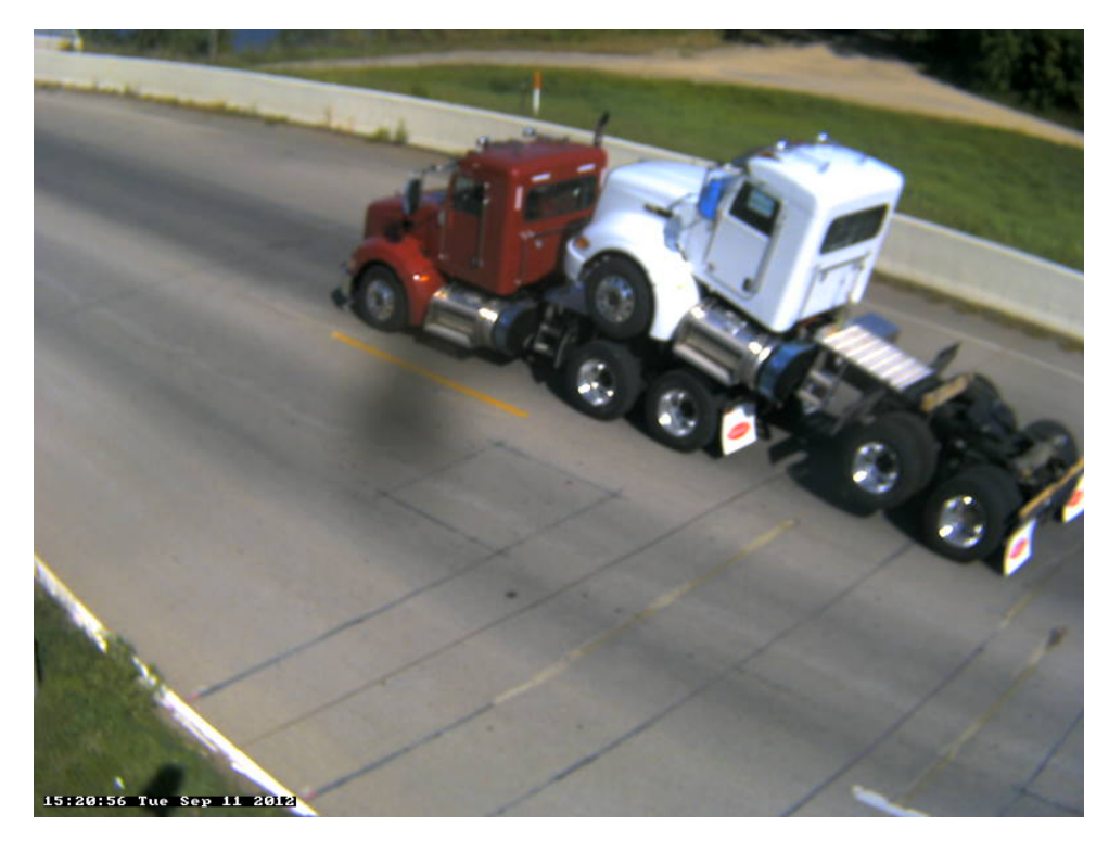
Photo 26B: Class 8, 4 axle, Semi-Tractor; with another piggy-backing.