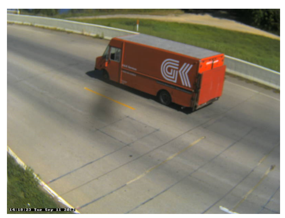
Photo 29B: Class 5, 2 axles, Single Unit; Service Truck; Service Industry.