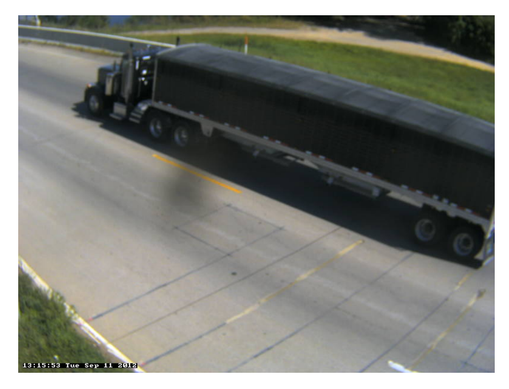
Photo 19A: Class 9, 5 axle, Semi-Tractor with Trailer; Grain Box; Grain.