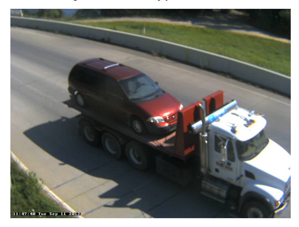
Photo 12B: Class 6, 3 axles, Single Unit; Flatbed, Full. Notice this is the same vehicle as above just loaded and going in the opposite direction.