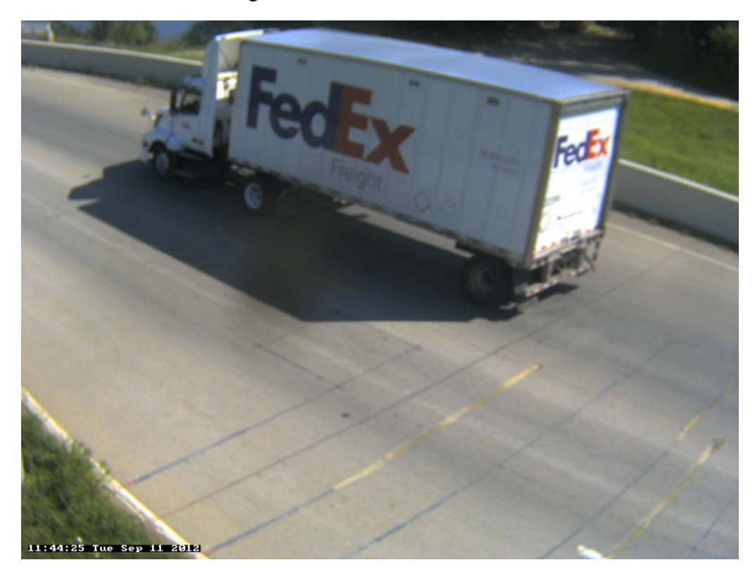
Photo 3B: Class 8, 3 axle, Semi-Tractor with Trailer; Box; Shipping.