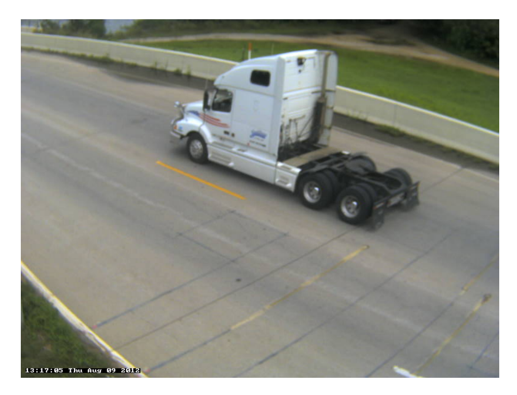
Photo 26A: Class 6, 3 axle, Single Unit; Semi-Tractor w/o Trailer.