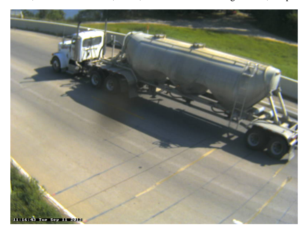
Photo 31B: Class 9, 5 axle, Semi-Tractor with Trailer; Tanker; Dry Bulk Tanker.