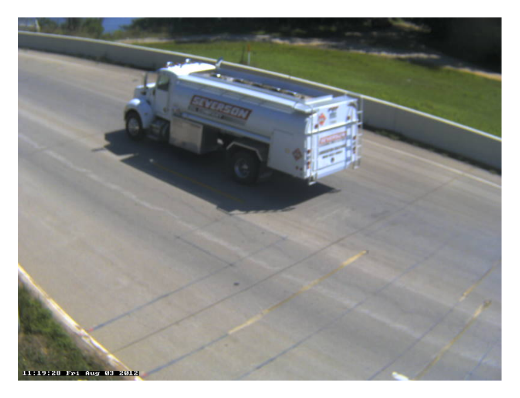
Photo 34A: Class 5, 2 axle, 6 tires, Single Unit; Tanker; Fuel; Petroleum.