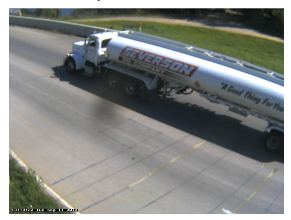
Photo 34B: Class 9, 5 axle, Semi-Tractor with Trailer; Tanker; Fuel; Petroleum.