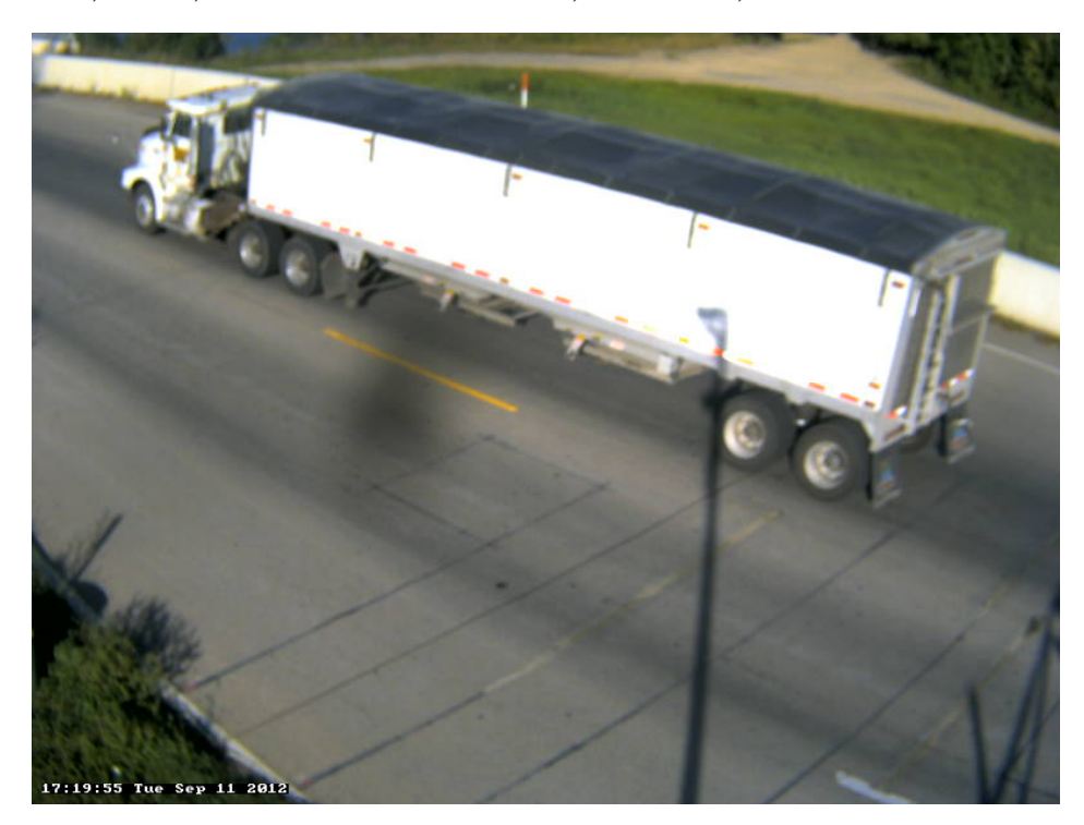
Photo 19B: Class 9, 5 axle, Semi-Tractor with Trailer; Grain Box; Grain.