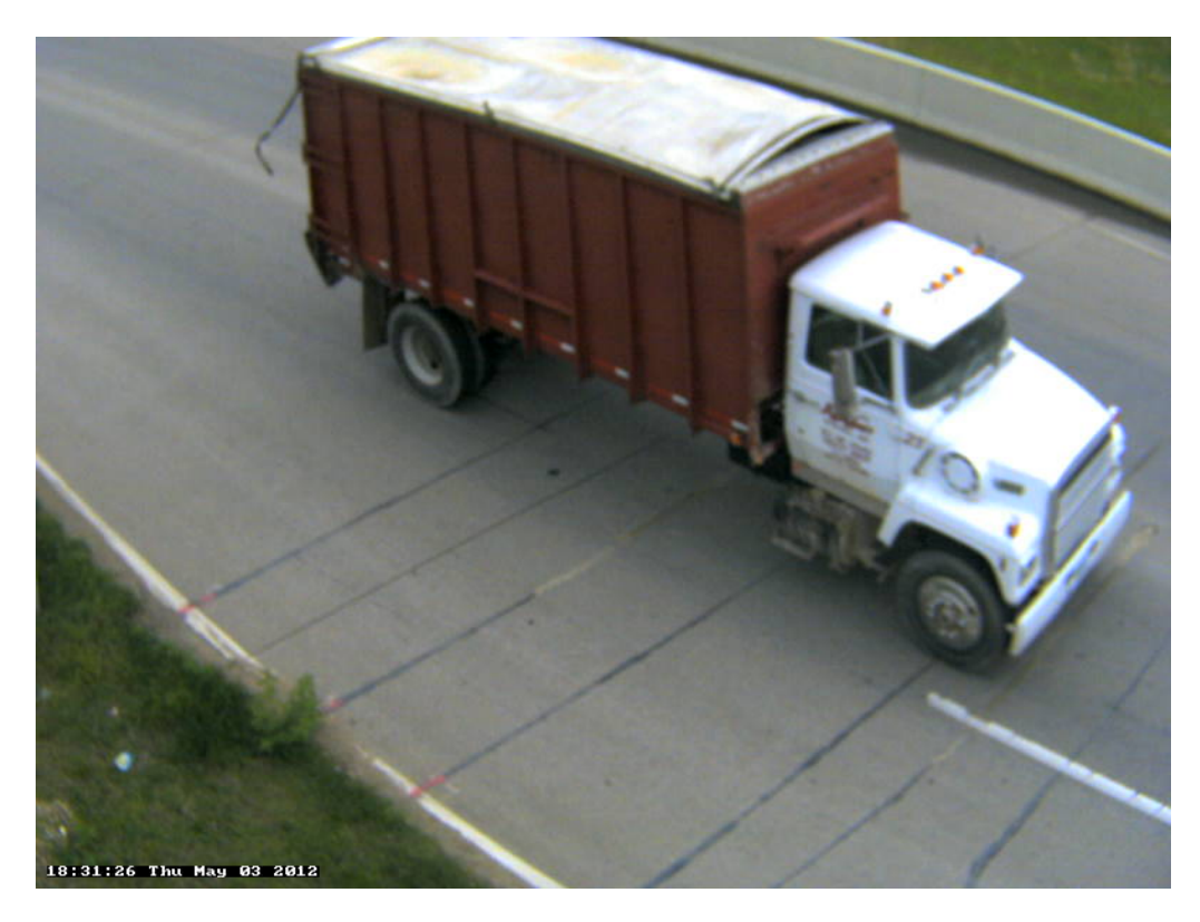
Photo 22A: Class 5, 2 axles, Single Unit, Grain Box, Agriculture; Grain.