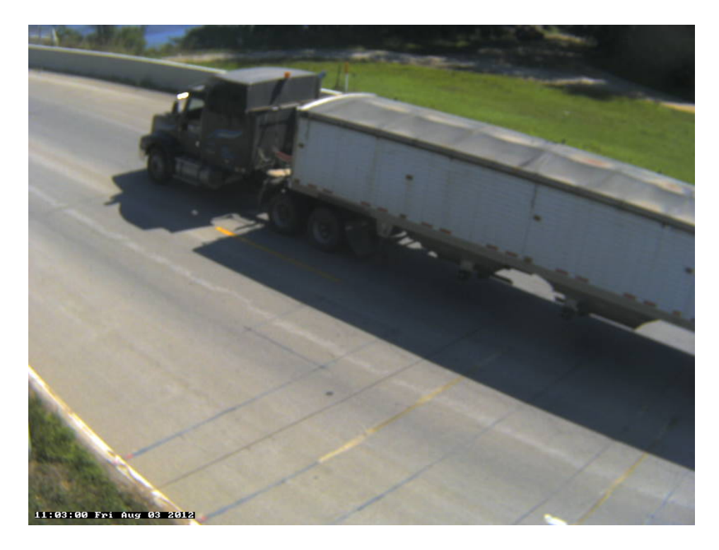
Photo 18A: Class 9, 5 axle, Semi-Tractor with Trailer; Grain Box; Grain.