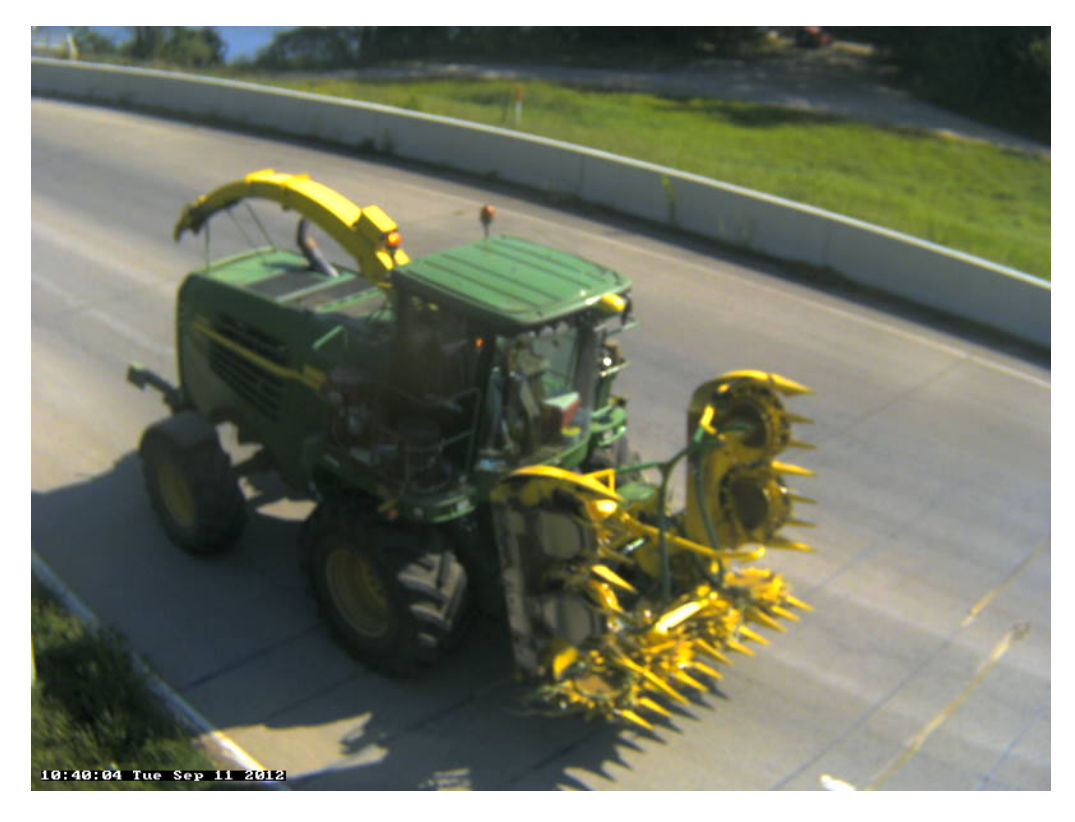
Photo 11A: Class 5, 2 axle, Single Unit; Farm Equipment, Agriculture.