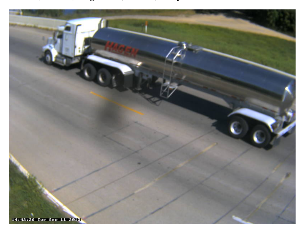
Photo 33B: Class 9, 5 axle, Semi-Tractor with Trailer; Tanker; Food; Dairy.