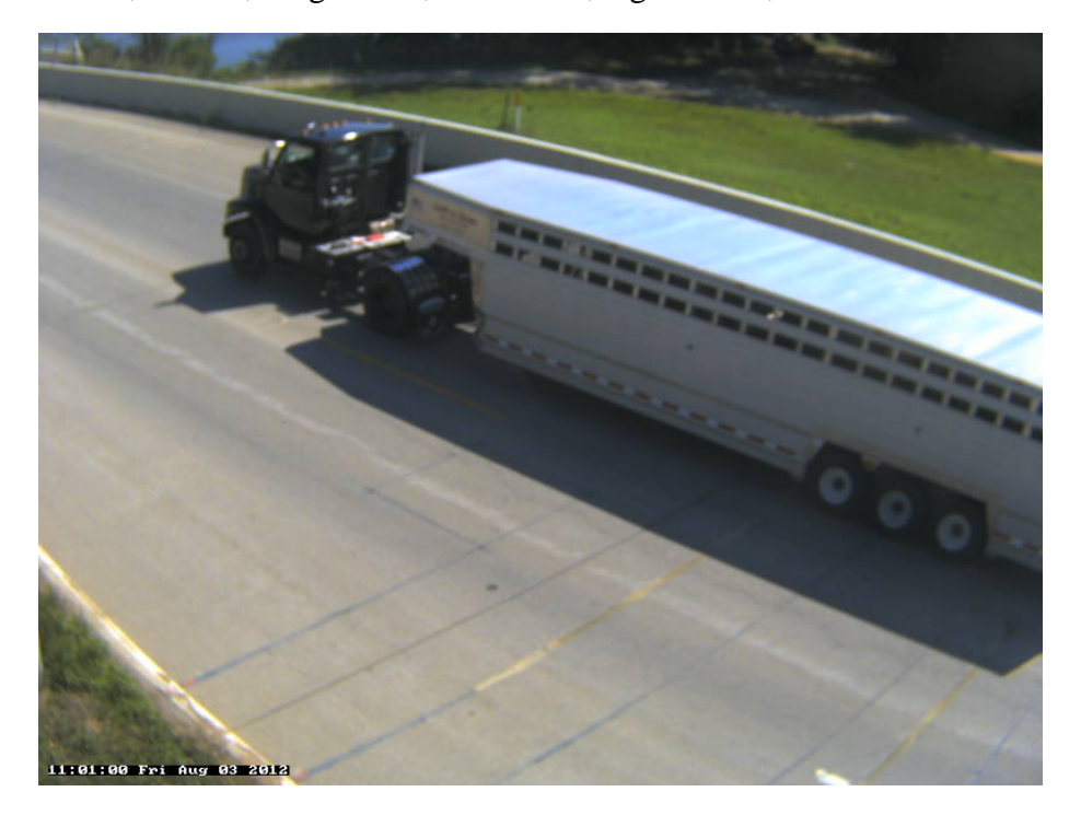
Photo 22B: Class 9: 5 axle, Semi-Tractor with Trailer; Agriculture; Livestock.