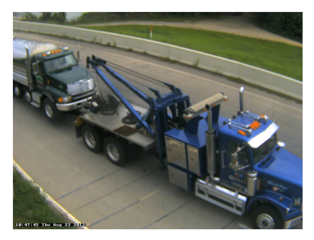
Photo 28A: Class 9, 5 axles, Semi-Tractor with Trailer; Service Truck; Tow Truck.