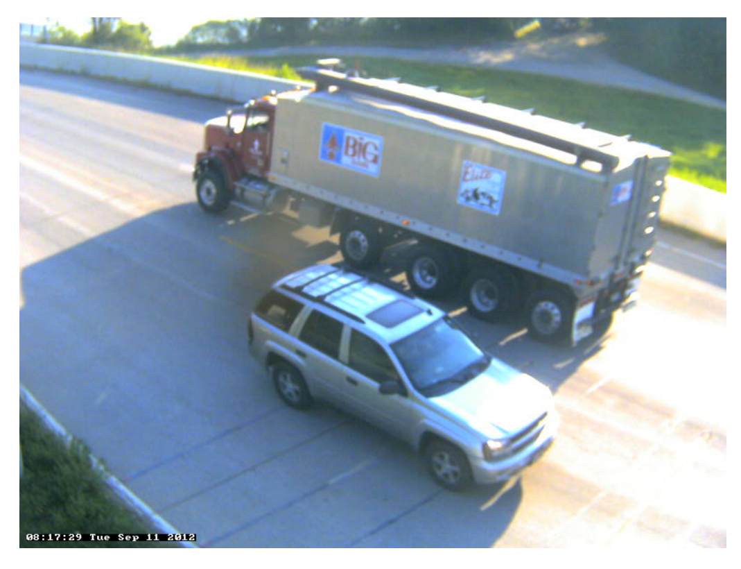
Photo 20A: Class 7, 4+ axles, Single Unit, Grain with Feed Auger; Grain.