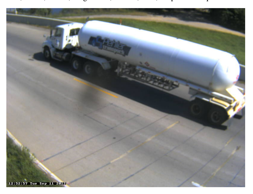
Photo 35B: Class 9, 5 axle, Semi-Tractor with Trailer; Tanker; Fuel; Propane or LNG.