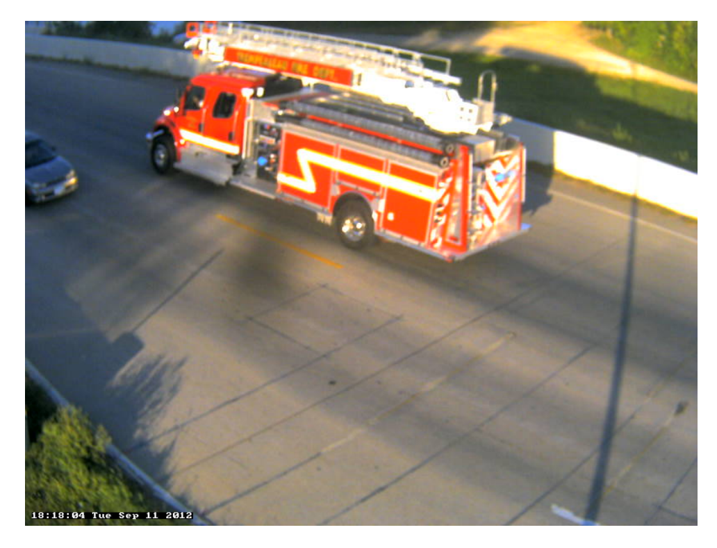
Photo 27A: Class 5, 2 axles, Single Unit; Service Truck; Emergency Vehicle.