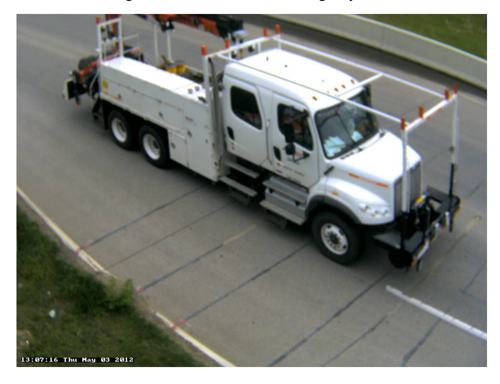
Photo 27B: Class 6, 3 axles, Single Unit; Service Truck; Shipping, Railroad Maintenance Vehicle.