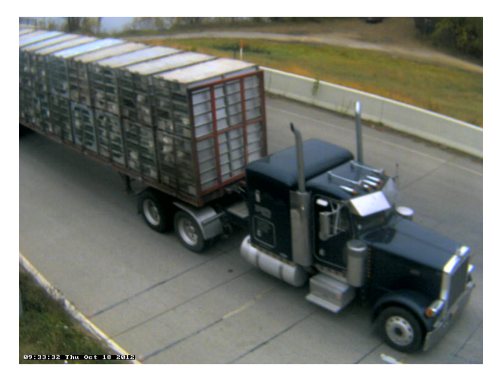
Photo 23A: Class 9, 4 axle, Truck with Trailer; Agriculture; Livestock, Poultry.