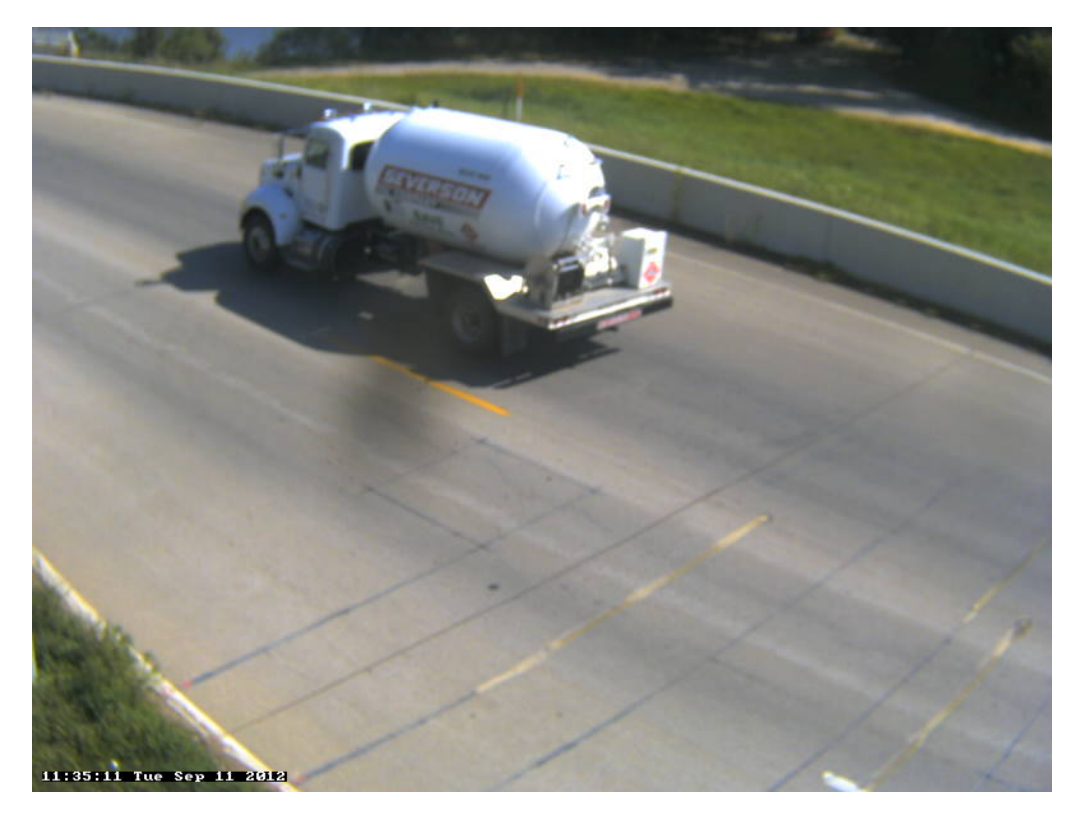
Photo 35A: Class 5, 2 axle, 6-tires, Single Unit; Tanker; Fuel; Propane or Liquid Natural Gas (LNG).