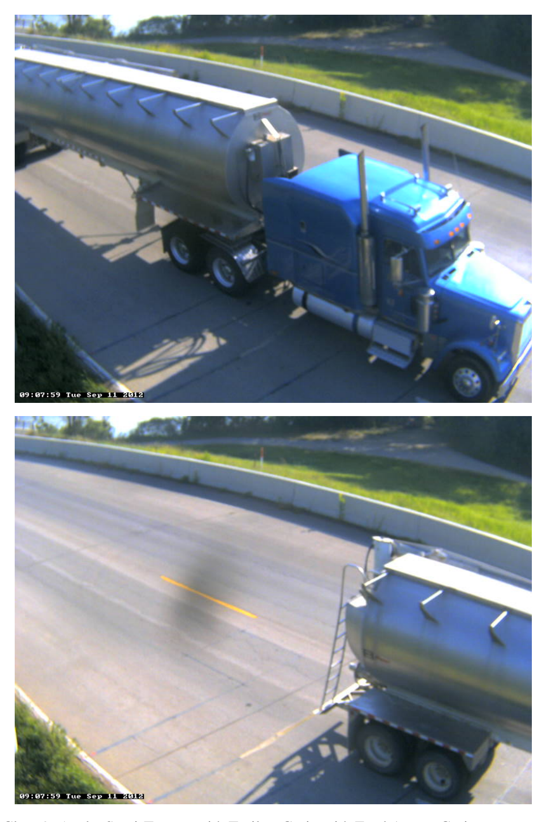
Photo 21: Class 9, 5 axle, Semi-Tractor with Trailer; Grain with Feed Auger, Grain.