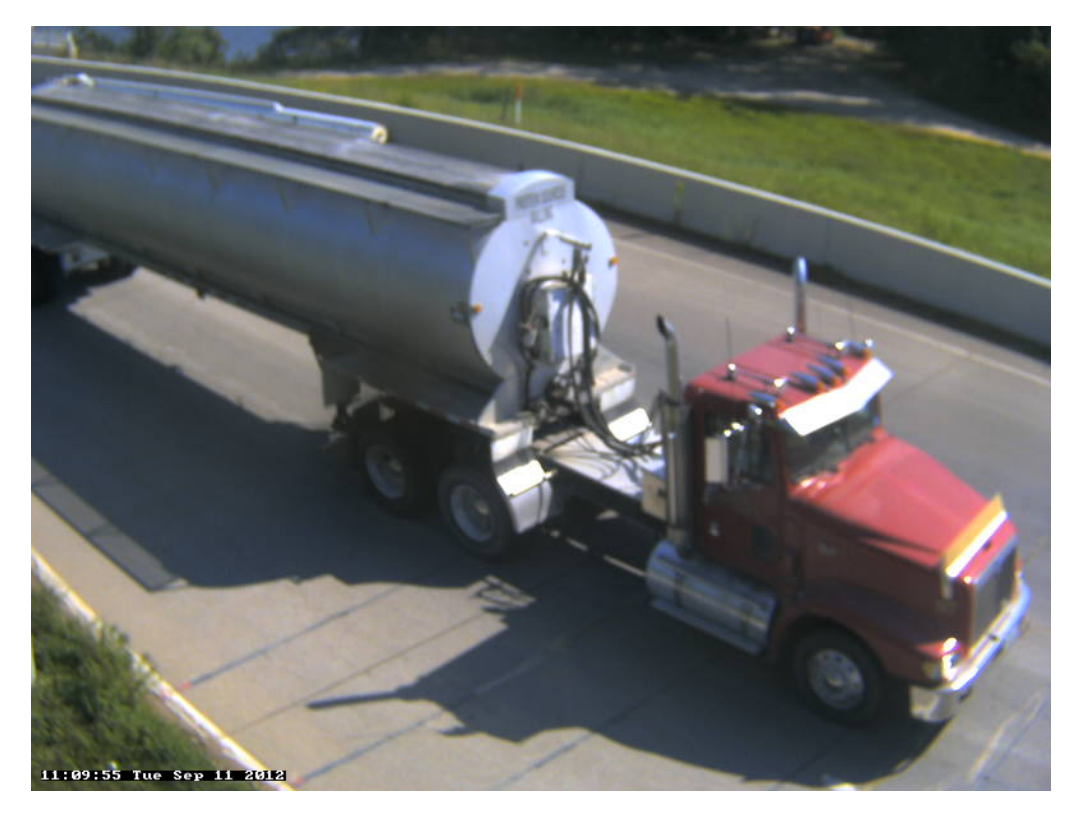
Photo 20B: Class 9, 5 axle, Semi-Tractor with Trailer; Grain with Feed Auger, Grain.