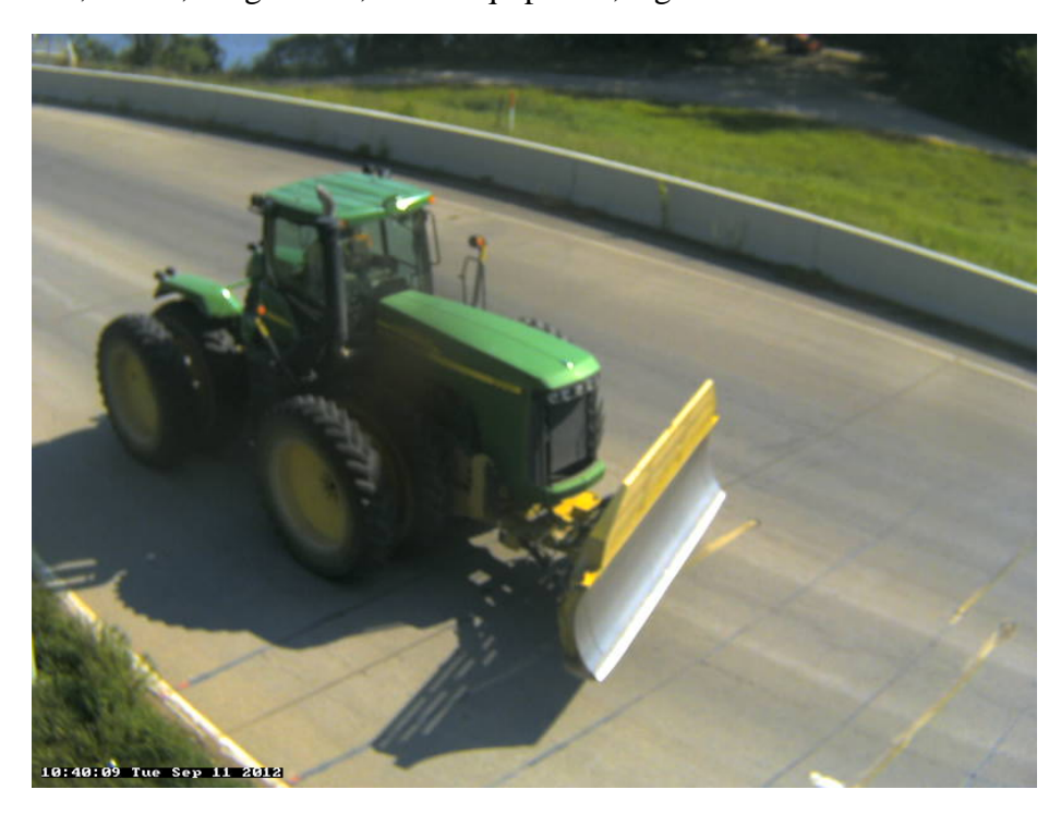
Photo 11B: Class 5, 2 axle, Single Unit; Farm Equipment, Agriculture.